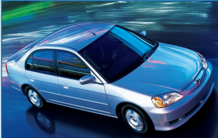
The fuel-sipping Civic Hybrid looks like a regular Honda? That's the point.